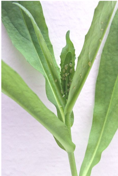
FIGURE 1 Green peach aphid, Myzus persicae , on Camelina sativa plant

plug. Emerged parasitoids were sexed and then stored at -80^{\circ}\text{C} for further measurements. Left hind tibia length was used as a proxy for parasitoid size. It was measured under a stereomicroscope (LEICA M165C) on 30–35 randomly selected parasitoid females for each N treatment \times host aphid species combination.