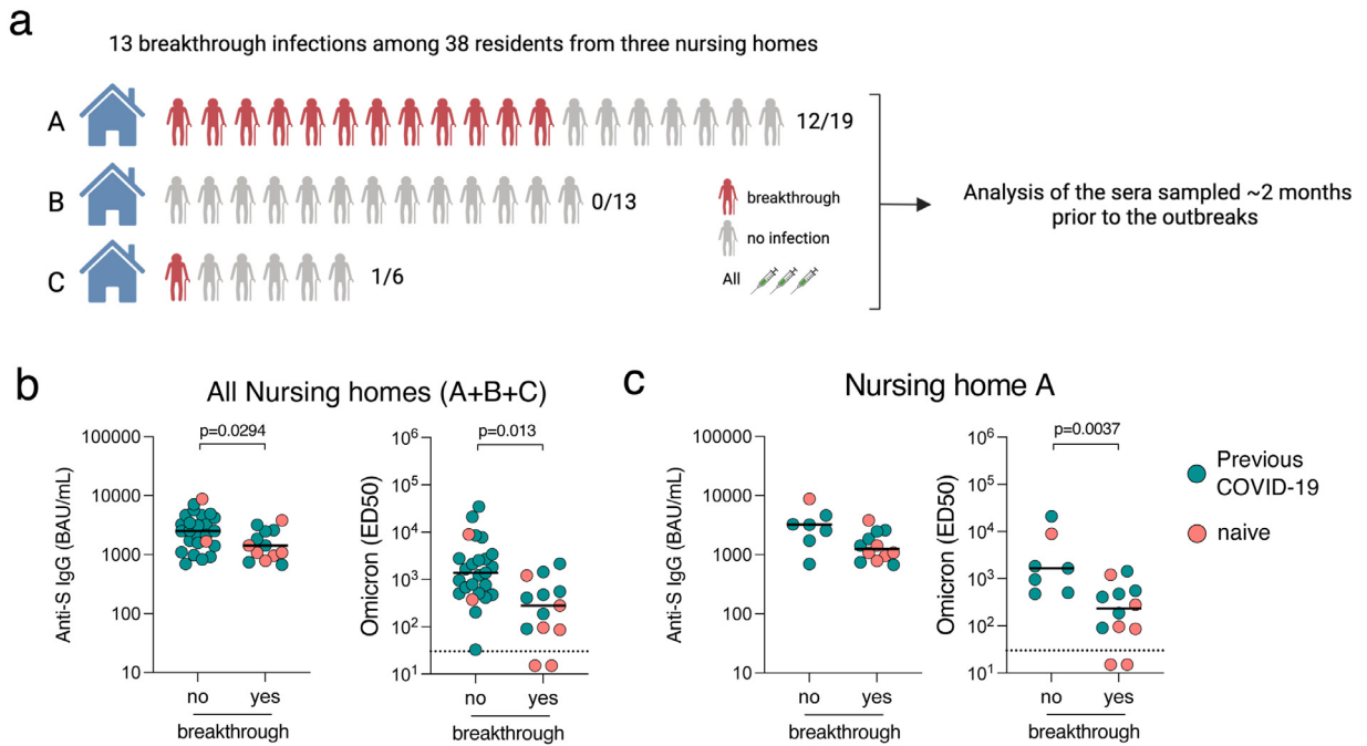
Figure 2. Humoral immune response predicts odds of omicron breakthrough infection. (a) Omicron breakthrough infections were reported in the 3 nursing homes included in the study, including 13 breakthrough infections among our study participants. The number of individuals included in our study, as well as the number of breakthrough infections among them are indicated for each household (A, B and C). We collected sera prior to the outbreaks (median (range) of 53 (49-60) days before the breakthrough infection, corresponding to 55 (49-59) days after the booster dose) (b) Levels of anti-Spike IgGs and neutralisation of omicron are indicated for individuals from the three households (A, B and C) having a subsequent confirmed breakthrough infection or not. (c) Levels of anti-Spike IgGs and neutralisation of omicron are indicated for individuals from the household A having a subsequent confirmed breakthrough infection or not. Data are provided as Binding Arbitrary Unit per mL (BAU/mL) (left) and neutralisation titers (ED50) (right). Comparisons were performed using the Mann-Whitney rank test. Green dots indicate individuals with an history of COVID-19 prior to their booster dose of vaccine. Pink dots indicate individuals with no previous COVID-19. The dashed line indicates the limit of detection of the neutralisation assay (30). The limit of detection of the anti-Spike assay is 3 BAU/mL. Black bars indicate the median.

particularly aged population to prevent infection with omicron, a variant known for its high immune escape properties. Recent data suggest that the fourth dose rescues antibody titers to the levels obtained after the third dose, but does not increase cross-reactivity. 29 It remains to determine whether the third dose achieves this kind of “ceiling of immunity” in elderly individuals, in whom vaccine immunogenicity is reduced. A fourth dose will rescue antibody levels and prolong protection, as demonstrated in recent nation-wide clinical trials. 30,31 Of note, the absence of severe forms of disease in our omicron-infected group is reassuring, however based on a small sample size.