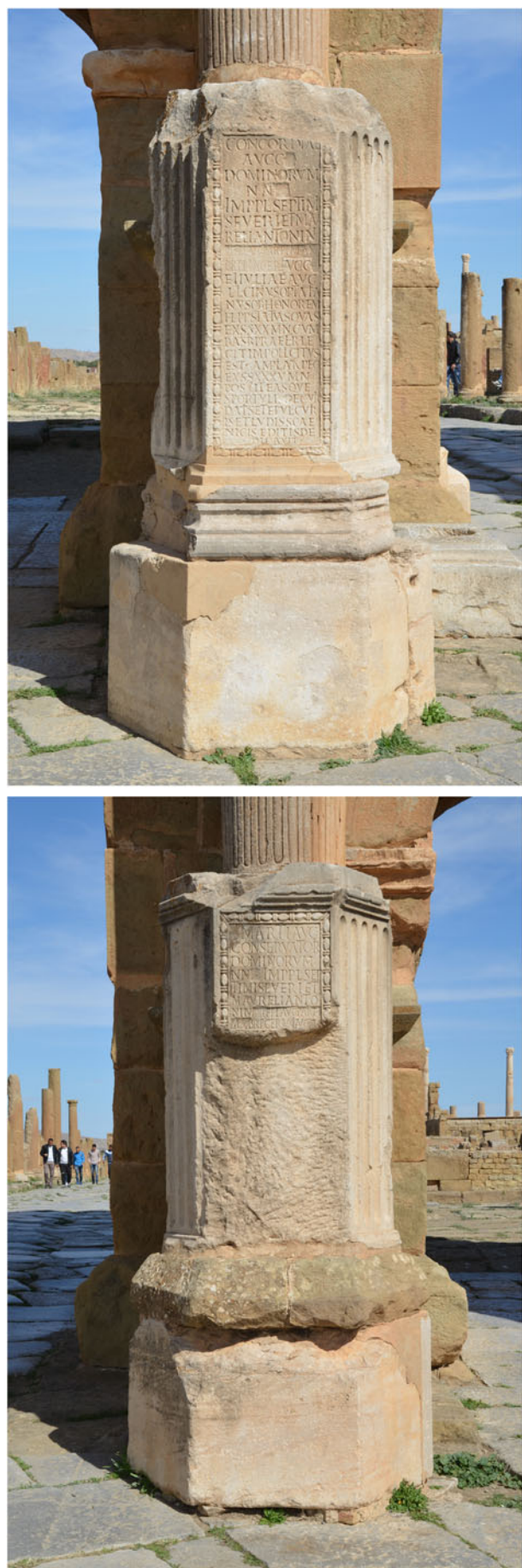
Figure 8. Inscribed bases set up in front of the western gate. A: northern pillar; B: southern pillar.

highly urbanized or militarized areas such as Numidia (Woolf 1996, 37). The particularly high concentration of inscriptions at Lambaesis and Timgad is easily explained. Literacy was a prerequisite for advancement in military service and veterans were probably the main inhabitants of the colony in the early days. The use of epigraphy implied an understanding of the Latin language and an endorsement of the epigraphic practice by the inscribers. These were the upper categories of society, which is confirmed, conversely, by the absence of inscriptions on almost all the stelae dedicated to Saturn found at Timgad, a cult generally associated with the less Romanized groups of the population (Fentress 1981, 400). The level of literacy of the population was limited to a phonetic deciphering of the texts, facilitated by the use of capital letters on the inscriptions, but which did not necessarily imply an understanding of cursive writing. The understanding of inscribed texts was also based on the repetition of formulas, sometimes abbreviated, which once memorized were more easily understood on other similar texts (Corbier 2006, 83–89).