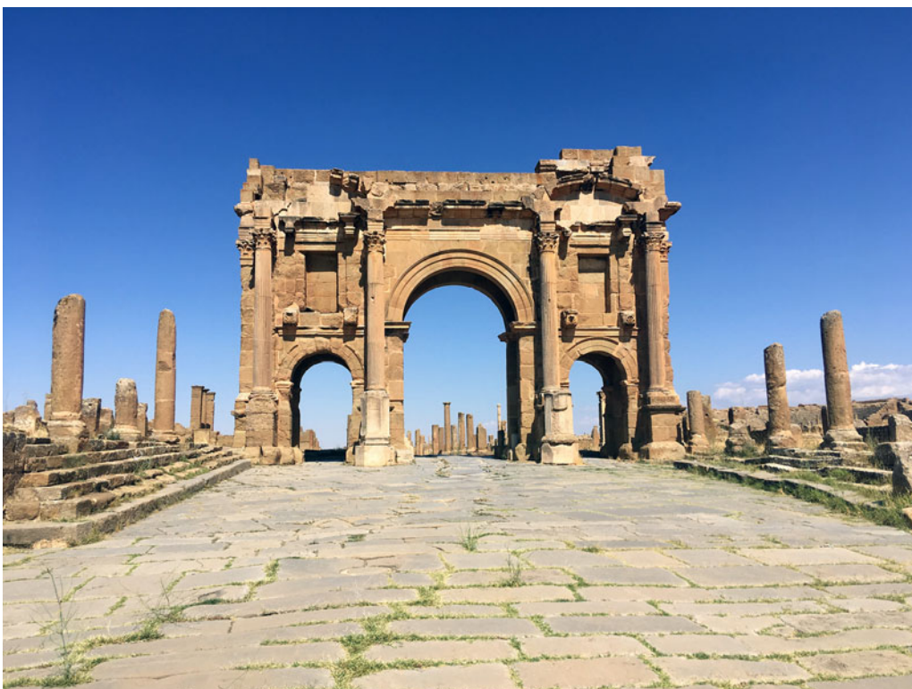
Figure 4. The western gate viewed from the west. Note in the left foreground the steps of the Temple of the Genius Coloniae.

element could accommodate writing, be the support of a text, without having any direct link with it, unlike statues or monument dedications. The monument itself will then serve as a spatial reference for the location of certain types of documents in the urban space (Corbier 2006, 35–37). The addition of two bases and statues in front of the western gate in the Severan period has been mentioned. Let us move away from the period under consideration for a moment to point out that some milestones