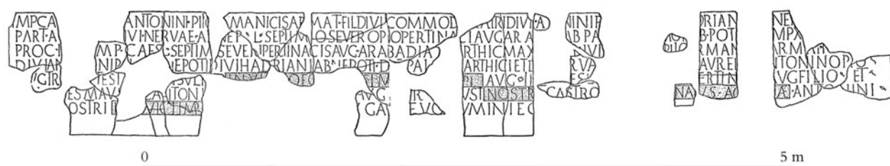
Figure 6. Severan inscription CIL VIII, 17872 possibly belonging to the western gate (Doisy 1953, figure 2. Scale is approximative).

(Figure 9), dating from the end of the third to the end of the fourth century AD, have been discovered in the vicinity of the gate and must have been placed near it (Boeswillwald et al. 1905, 146–50). 5 The gate became such a ‘familiar landmark’ that over time it was the obvious receptacle of various inscriptions, and these added texts must have reinforced its role as a marker of the urban landscape (Cassibry 2018, 264–65). The absence of any number at the end of the text inscribed on the pillars suggests that distances were calculated from the gate: almost three centuries after the foundation of the city, and when its expansion reached at least the gates built under the Antonines, not only did the gate remain the point of reference for Timgad, but it was preferred to the forum (4), which nevertheless represented the symbolic and almost topographical centre of the city