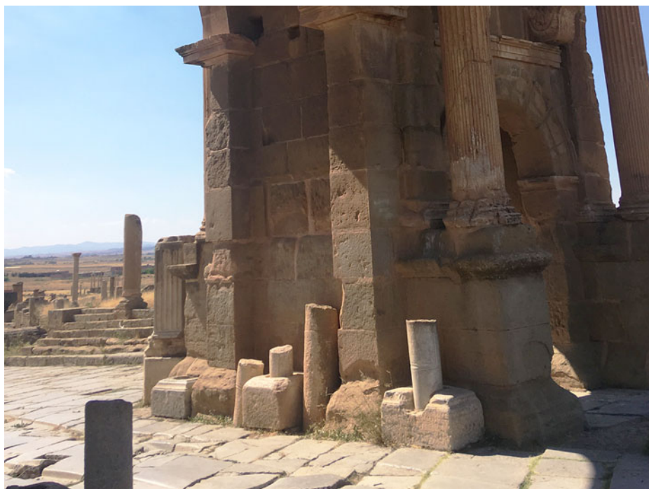
Figure 9. Milestones under the western gate (photo Terrae Transmarinae, Flickr, CC BY-NC-SA 2.0).

sought urban memory not in the monuments but in the void left between them. He argued that the street plan of the city was a 'primary element, the equal of a monument like a temple or a fortress'. His central argument, that research on the plan of a city can reveal its structure (the soul of the city), is based on the work of Halbwachs. Developing these considerations, he argued that 'the city itself is the collective memory of its peoples, and like memory it is associated with objects and places. The city is the locus of collective memory' (Rossi 1984, 130).