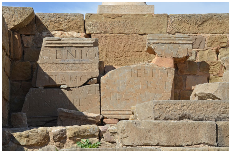
Figure 14. Inscribed stone of the dedication of the Temple of the Genius Coloniae , AE 1968, 647 (photo A. Wilson, Manar al-Athar).

the inscriptions of the early Roman period attest to this – one of them coming from the Great East Baths, dated to AD 167–68 (Tourenco 1968, 215), the other from the Great South Baths, dated to AD 198–99 and mentioning an extension of the building (AE 1894, 44). The latter baths were also restored during the Late Antiquity (CIL VIII, 2342). Yvon Thébert underlines the specificity of these operations, not financed by public funds but by a very practical investment of the two components of the city, the popular categories offering their labour force, the ruling elite their money: the inscription celebrates this operation by dedicating it to the concordia populi et ordinis . We observe here the essentially civic character of the baths, which contributed to reviving the memory of the community within the urban space of Timgad. In any case, stones communicated a message that existed on two levels: the text itself represented a level of meaning but it also had an embedded social meaning. Monuments and texts were perceived differently by individuals, depending on their gender, ethnic origin or social category, who constructed their own experience of the urban space (Revell 2009, 154, 179–80).