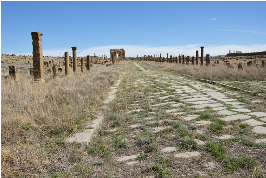
Figure 3. The western street with the western gate seen from afar, near the Fountain of Liberalis.

The public space was indeed suited to the display of honorific monuments and statues, or certain forms of writing such as official documents. The choice of location was either symbolic or functional: it was usually a celeberrimus locus , a particularly frequented place in the city, usually the forum or its surroundings, but also another public square. More broadly, any architectural