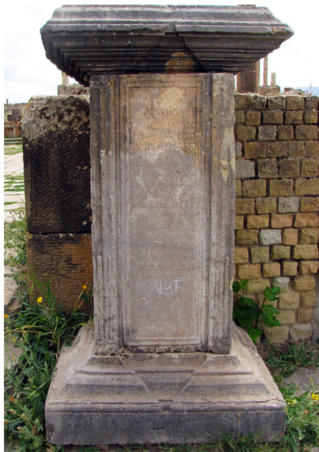
Figure 13. Inscribed base of the statue of Sertius CIL VIII, 2395 placed near the entrance of the market.

Various monuments in the city were in fact associated with a name. On arriving from the western road, one would come across the fountain of P. Iulius Liberalis (12), built in the mid-third century AD, whose inscription could be read without too much difficulty given the proximity of the building to the road (Lamare 2020, 32–35). A little further on, the basilica vestiaria (9) had no inscription on its façade, but next to it, the market was identified with Sertius and his wife thanks to an inscribed stela (ILS 5579). This was offered by the couple with the name SERTII appearing on the first line (Figure 12), to which were added two inscribed bases (CIL VIII, 2395–96) donated by their freedmen and placed on each side of the entrance (Figure 13), which began with the names SERTIO and SERTIAE, in larger letters, and were to support their respective statues. Opposite, on the other side of the road, the temple (8) had an inscription on its façade (AE 1968, 647) that clearly indicated its dedication to the Genius Coloniae (Figure 14) and provided the names of the euergetes. 8 These names must have been used as landmarks in this part of the city: the pronunciation of these names also revived the memory ( memoria ) of the dedicators, as was expected of those passing by tombs (Woolf 1996, 25–29; Corbier 2006, 87).