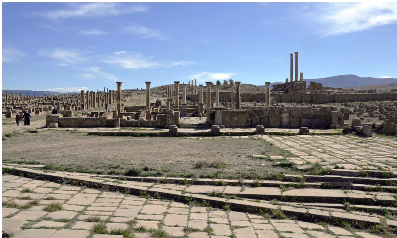
Figure 11. The Market of Sertius viewed from the street.

Landmarks are a structuring element of interest (Lynch 1960, 78–83). They are prominent elements of the cityscape and vary greatly in scale: either the element is visible from many places, or it contrasts with the surrounding structures by a variation in alignment or height. The great public monuments of the ancient city, the theatre, the Capitolium, the great baths and the gates correspond to this first criterion, while the market of Sertius (Figure 11) or the eastern market meet the second criterion by the shift of their façade from the street.