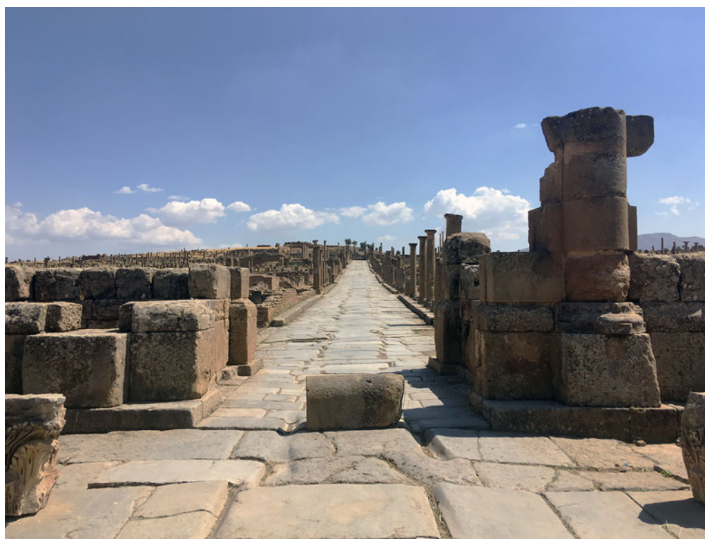
Figure 10. The north-south street seen from the northern gate.

medieval origin, offers tourists and passers-by a very different landscape from the later extensions, in a reverse situation as far as the built-up area is concerned, a centre of small intertwined streets opposed to developments with more regular streets. One cannot fail to notice this when visiting Dubrovnik, Avignon or Carcassonne.