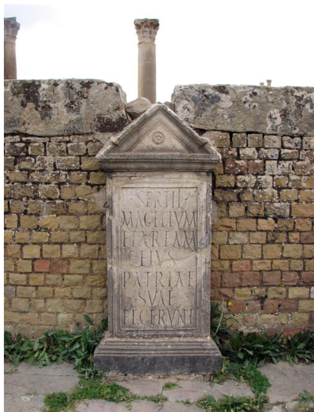
Figure 12. Inscribed stela ILS 5579 placed on the façade of the Market of Sertius.

These public buildings, often visually imposing, were therefore supposed to be landmarks for traffic and wayfinding in the city. The question of house or shop addresses has already been examined, mainly on the basis of written sources (Ling 1990; Béranger 2008). The latter do not indicate that an address was used as it is practiced nowadays in western Europe, but that vici , which were often associated with the name of a temple or an important public building (Castrén 2000; Béranger 2008, 166–67), or monuments, which bore the name of the honoured god or of the benefactor, did not aim at accuracy but offered a general indication of the sector (district, neighbourhood) in which one dwelt.