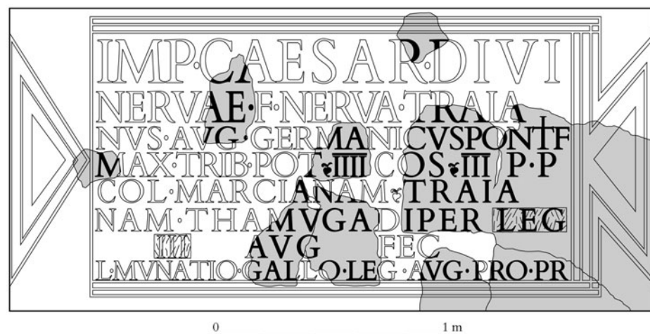
Figure 7. Hypothetical reconstruction of Trajanic inscription CIL VIII, 17843 belonging to the northern gate (image N. Lamare, after Boeswillwald et al. 1905, 127, figure 57).

This accumulation of texts raises questions about the intended audience for these inscriptions. This has been discussed many times for the Roman world but let us consider the situation at Timgad. The larger clusters of inscriptions have been found in