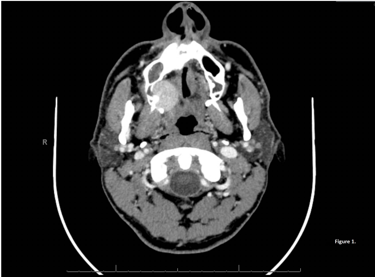
Figure 1. CT image, axial view, showing a well-limited tissular lesion with contrast enhancement after iodine injection corresponding to a sinonasal SFT.

Four patients presented with local extension to the bone, and one patient with cervical localization of an SFT presented with nerve extension. MRI was performed in 15 cases only. Tumors were isointense in nine cases and hypointense in five cases on T1-weighted images and were hyperintense in 11 cases versus hypointense in three cases on T2-weighted images. In every case, contrast enhancement after gadolinium injection was found. An example of the MRI aspect of SFT is shown in figure 2(A, B, C, D).