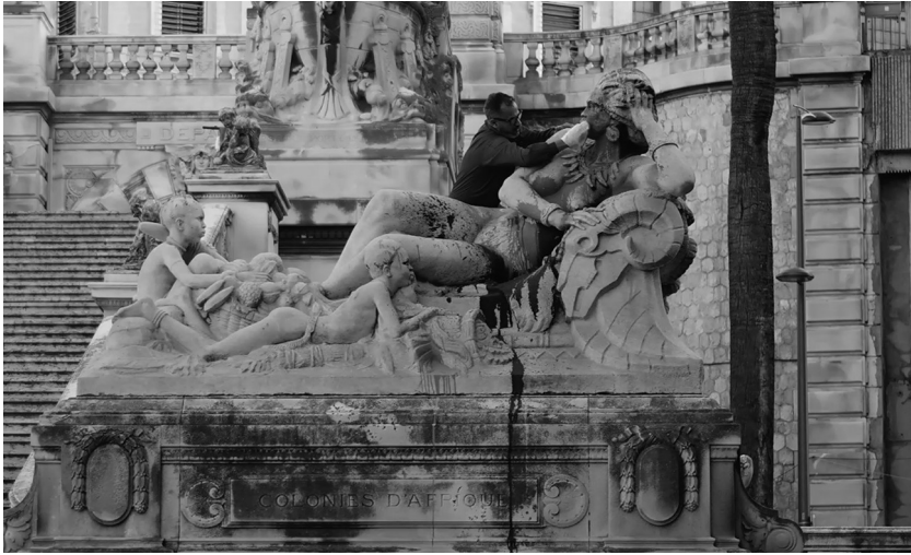
Figure 12.4 Mohammed Laouli, Les Sculptures N'Étaient Pas Blanches , 2020, video. Copyright Mohammed Laouli/ECHOES.

Mohammed Laouli: In Ex-Voto , I had made marble plaques on which I said, 'Thank you for colonization'. There, I am taking care of the colony. I am giving thanks. In Ex-Voto , I was starting from colonial facts and events such as the Berlin Conference. I found it interesting to make a Catholic ex-voto from a marble plaque. 9 It was conscious and intentional. There is an irony. A bitterness. There is the balance of power: you (the colonizer) consider me weak. I am the dominated one. So, I let you believe that you dominate me.