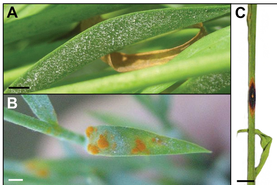
Figure 2. Symptoms of air-borne diseases in flax. (A) White powdery mildew ( Podosphaera lini ) colonies (mycelia) on flax leaf; bar = 0.2 cm. (B) Rust ( Melampsora lini ) orange powdery pustules (uredia) on flax leaf; bar = 0.2 cm. (C) Dark brown circular lesion of necrosis produced by rust ( Melampsora lini ) on flax stem; bar = 1 cm. (Credits: Arvalis).

Erysiphe cichoracearum in old records) has been reported in flax from various countries, including Asia, Europe and North America. Leveillula taurica is known in a wide range of hosts and has been reported in flax in warm and arid regions [32]. In many reports, the name Oidium lini is used for flax powdery mildew. This is an invalid name, and O. lini in flax may refer to E. lini , G. orontii or P. lini resulting in many unclear records from different parts of the world. Nowadays, O. lini is regarded as a synonym of P. lini [33]. All these pathogens are obligate biotrophic ascomycetes and produce similar symptoms: the surface of leaves, stems and sepals are covered with white powdery colonies (Figure 2A). They are composed of white mycelia and conidia but can also include smaller dark sexual fruiting bodies, named chasmothecia, which stay as resting structures until favorable conditions for sporulation are fulfilled. Once spores have been produced, splashing and wind can easily spread the pathogen to other plants around. This disease emerges under hot and dry conditions, particularly toward the end of spring when flax is in the pre-flowering stage [34]. Severe infection causes the senescence of stems and leaves, which ultimately lead to plant death [1].