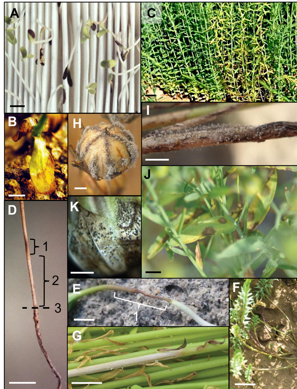
Figure 3. Symptoms of seed-borne diseases in flax. (A) Dark red spots of Alternaria blight ( Alternaria linicola ) on cotyledons and collar 3 days after germination of flax seedlings grown on wet paper; bar = 1 cm. (B) Anthracnose ( Colletotrichum lini ) symptoms in flax cotyledons; bar = 1 cm. (C) Boeremia exigua lesions on flax stems in the field, starting from a cluster of 5 to 10 plants; bar = 5 cm. (D) Details of Boeremia exigua symptoms in basal flax stem, above collar (3), displaying brown (1) and discolored (2) areas; bar = 1 cm. (E) Dark brown lesion (1) caused by Aureobasidium lini on field flax seedling (collet); bar = 0.5 cm. (F) Brown and broken field flax stems due to Aureobasidium lini ; bar = 10 cm. (G) Gray color of flax stem due to the presence of Botrytis cinerea colonies; bar = 2 cm. (H) Botrytis cinerea gray mold on flax bolls; bar = 0.2 cm. (I) Botrytis cinerea gray, brown and black spots on decaying flax stem; bar = 0.5 cm. (J) Brown senescent areas in flax leaves due to Septoria linicola ; bar = 0.5 cm. (K) Sepals of flax bolls with Septoria linicola black spots (pycnidia); bar = 0.2 cm.

recommended since mycelia of C. lini can also be found in the seed coat. Several triazole-based fungicides are authorized outside of Europe to control this disease on flax, but since their foliar application cannot decrease the primary inoculum, this does not represent a long-term solution.